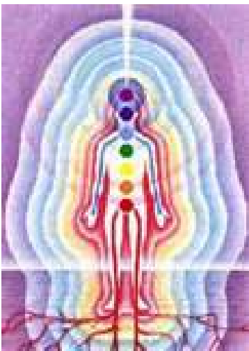
Picture of an aura showing position of chakras

Our auras reflect who we are and they extend out from the body. Everybody is different and there is no real set length that they extend. It can be anything between 1 and 5 feet. This can also depend upon our mood, our state of mind etc.